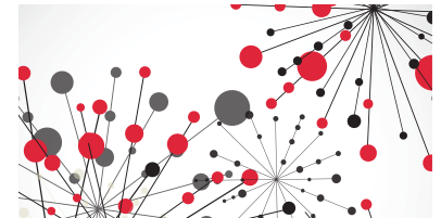
SOCIAL NETWORK ANALYSIS