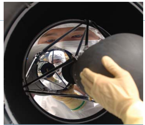
ARTEMIS baffle mirror assembly

As defined by the joint Operationally Responsive Space Office at Kirtland Air