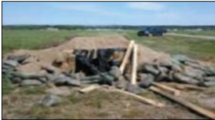
Bunker busting application