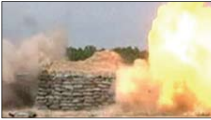
Bunker busting application