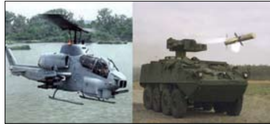
TOW Bunker Buster launches from all TOW platforms