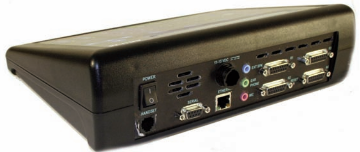
Photo caption: Upper: An ACU-M top panel showing LED indicators reflecting connection status and diagnostics for each port. Bottom: Rear view of ACU-M featuring audio, Ethernet, serial and power ports.

Sales Inquiries: CivComms.Sales@raytheon.com