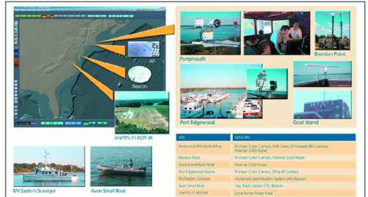
Raytheon Multi-Domain Awareness Fusion Center Testbed

Scenarios include global domain awareness across operational commands; surveillance across domains (land, air, sea); evaluation of operational concepts and technology; and border threats and interdiction. Operational deployments for border surveillance missions have demonstrated a robust, user-friendly and effective field C4ISR capability.