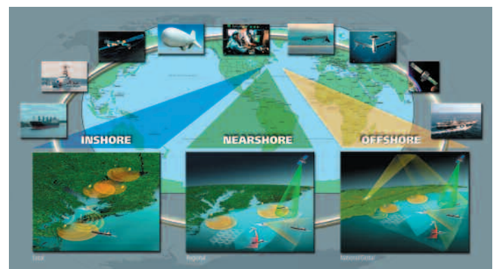
Shared Awareness Across C4 Centers

Athena's framework is based on a tiered, service-oriented architecture, uses off-the-shelf components and conforms to Department of Defense architecture framework standards. Athena adds value by providing rules-based anomaly analysis and software agent capabilities, along with network centric service capabilities.