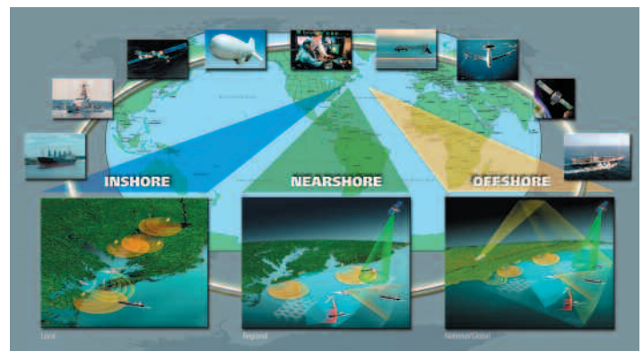
Shared Awareness Across C4 Centers

Athena's framework is based on a tiered, service-oriented architecture, uses off-the-shelf components and conforms to Department of Defense architecture framework standards. Athena adds value by providing rules-based anomaly analysis and software agent capabilities, along with network centric service capabilities.