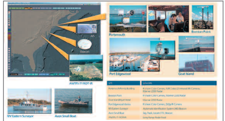
Raytheon Multi-Domain Awareness Testbed

Scenarios include global domain awareness across operational commands; surveillance across domains (land, air, sea); evaluation of operational concepts and technology; and border threats and interdiction. Operational deployments for border surveillance missions have demonstrated a robust, user-friendly and effective field C4ISR capability.