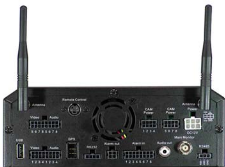
Raytheon’s Model 4000, powered by ICOP

The system is ideal for school buses, commercial transport, public transportation and long-term surveillance applications. Its increased flexibility and extended coverage allows surveillance of passenger cabin areas, driver areas, bus entrances and includes windshield-mounted cameras for recording areas in front of the bus such as cross walks and intersections.