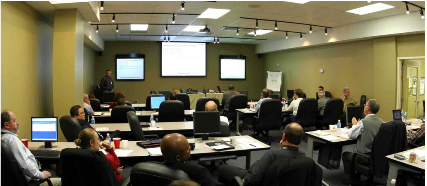
Training facility in Raleigh, North Carolina.