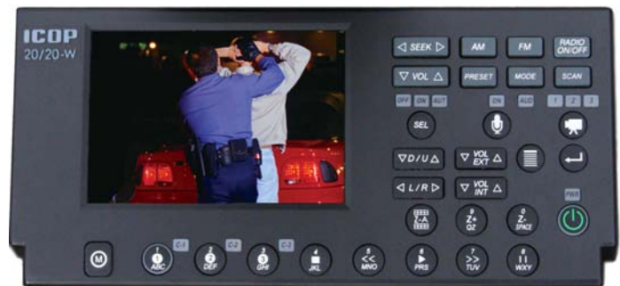
Raytheon's new mobile video solution, Powered by ICOP.